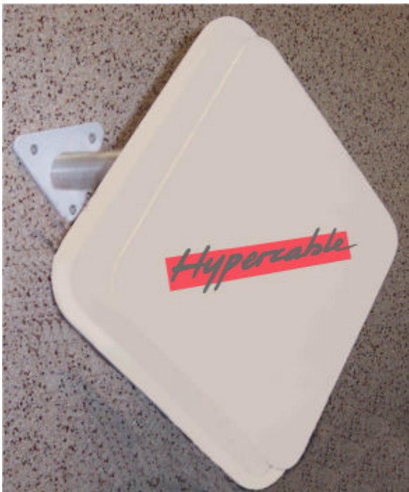
Planar Hypercable Antenna front view