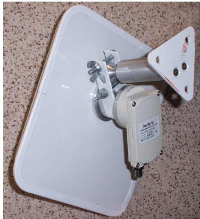
Planar Hypercable Antenna side view

The information contained in this document is a compilation of technical product specifications, for information purposes. From time to time we make changes in our products to better serve our customers. Technical specifications subject to change at any time without notice.